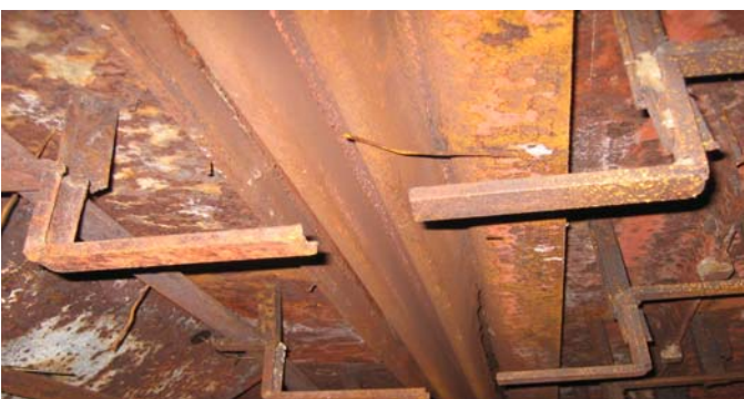
Combustion Engineering (CE) COR-TEN expansion joint - installed 1976

Stainless steel can develop cracks in the presence of chlorides, while COR-TEN does not. And stainless steel carries a hefty cost at almost $3/lb.